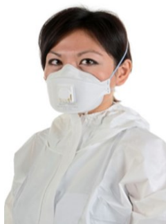
Figure 1 Disposable half mask

H13- Examples of types of tight-fitting facepieces are shown in Figures 1, 2 and 3.